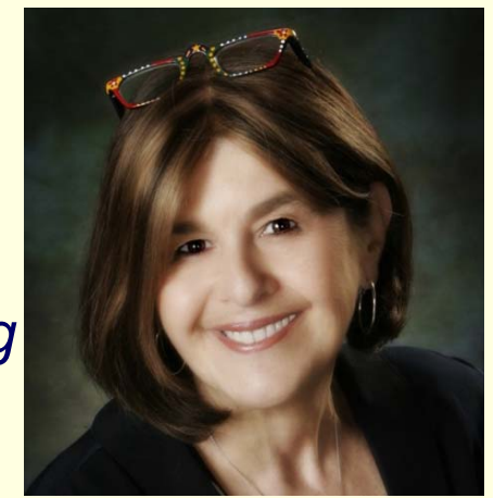
iRCOW Chief Executive